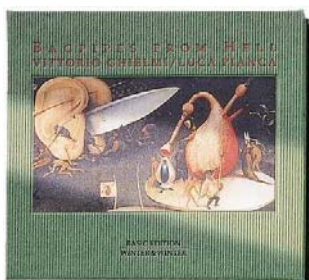
Bagpipe from Hell WINTER & WINTER