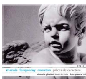
Pièces de Caractère OPUS 111/ NAÏVE 2002