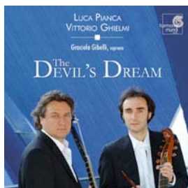
The Devil's Dream HARMONIA MUNDI