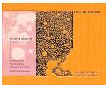
Full of colour WINTER & WINTER