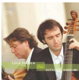
El canto del Cisne HARMONIA MUNDI