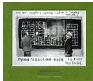
Die Kunst der Fugue WINTER & WINTER